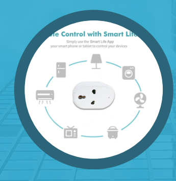
Smart Plug For Heavy Load