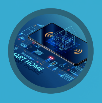
Smart Home Automation

We also have demonstrated the capability to work with IoT (Internet of Things) and integrate them with our automation systems like RFID cards, Biometric Attendance & Live Bus tracking through GPS integration