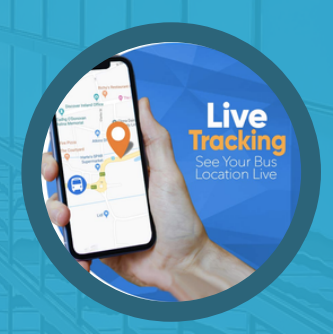
Live Bus Tracking